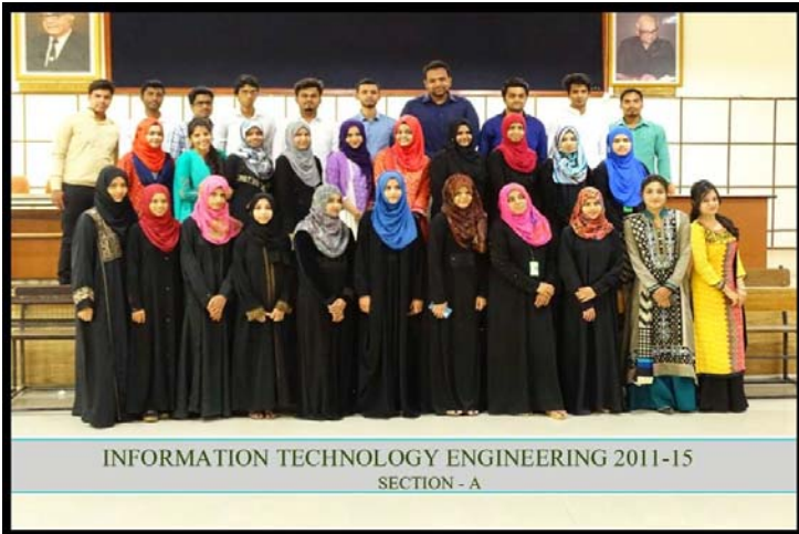
INFORMATION TECHNOLOGY ENGINEERING 2011-15 SECTION - A