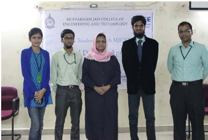
IEEE CIS Execom 2015