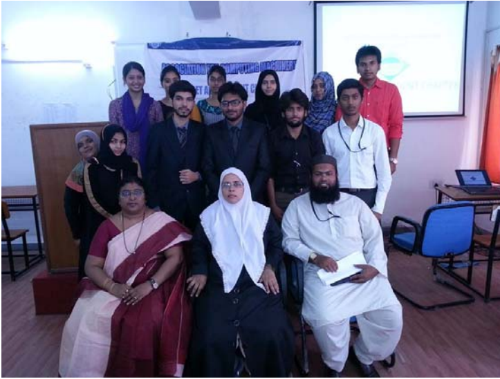
ACM Chapter Officers 2015-16 with new execom 2011 -15 PASSED OUT BATCH